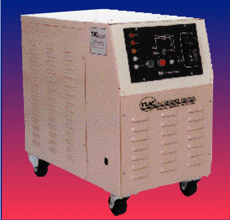
U Series (Compact)