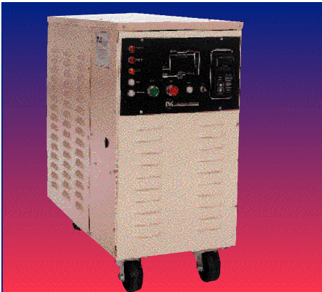
SU Series (Sub-Compact)